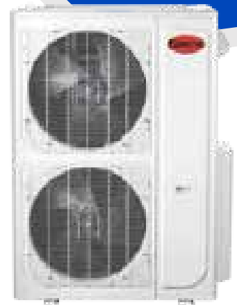
*Model M50F illustrated